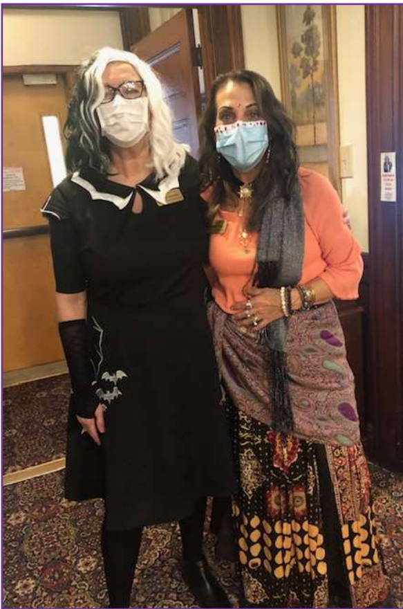
We still don't know who these two hooligans are....

“My Thanksgiving is perpetual. It is surprising how contented one can be with nothing definite ~ only a sense of existence.” Henry David Thoreau